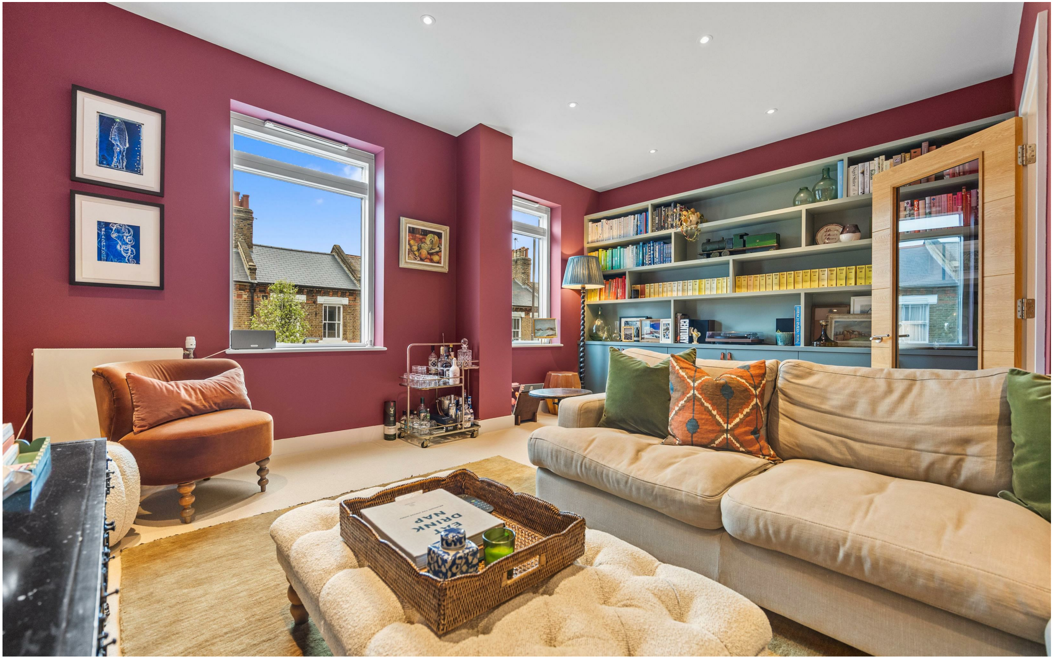
Dermot Terrace, Kilburn Lane W10